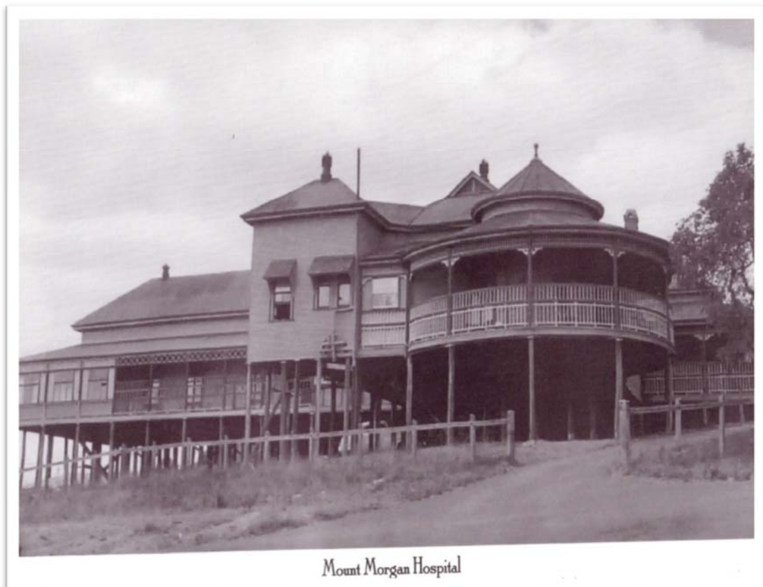
Mount Morgan Hospital