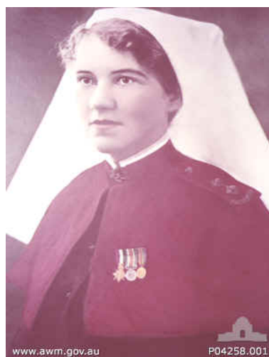
Sister Elizabeth Kenny

She developed Parkinson's disease and died on 30 th November 1952 in Toowoomba Queensland and was buried beside her mother in Nobby cemetery.